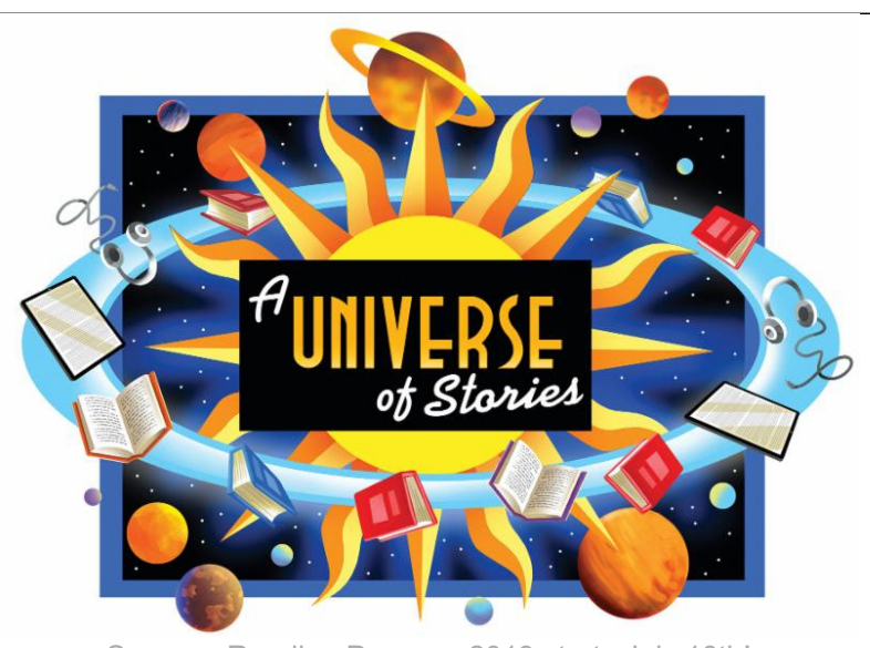
Summer Reading Program 2019 starts July 10th! Stop by the library to sign up.