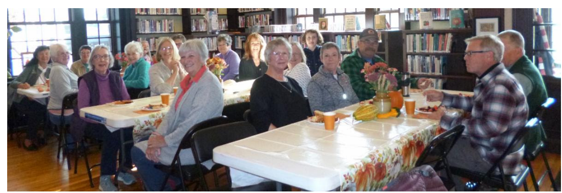
Volunteer Appreciation Breakfast 2019

grateful for all of the help. The old saying still hold true: "Many hands make light work."