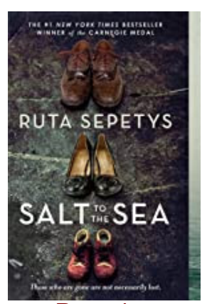
Rangeley Readers' November Pick

OWL Club meets every Thursday at 2:45 when school is in session. Preschool Story Hour meets at 10:00 AM on Fridays.