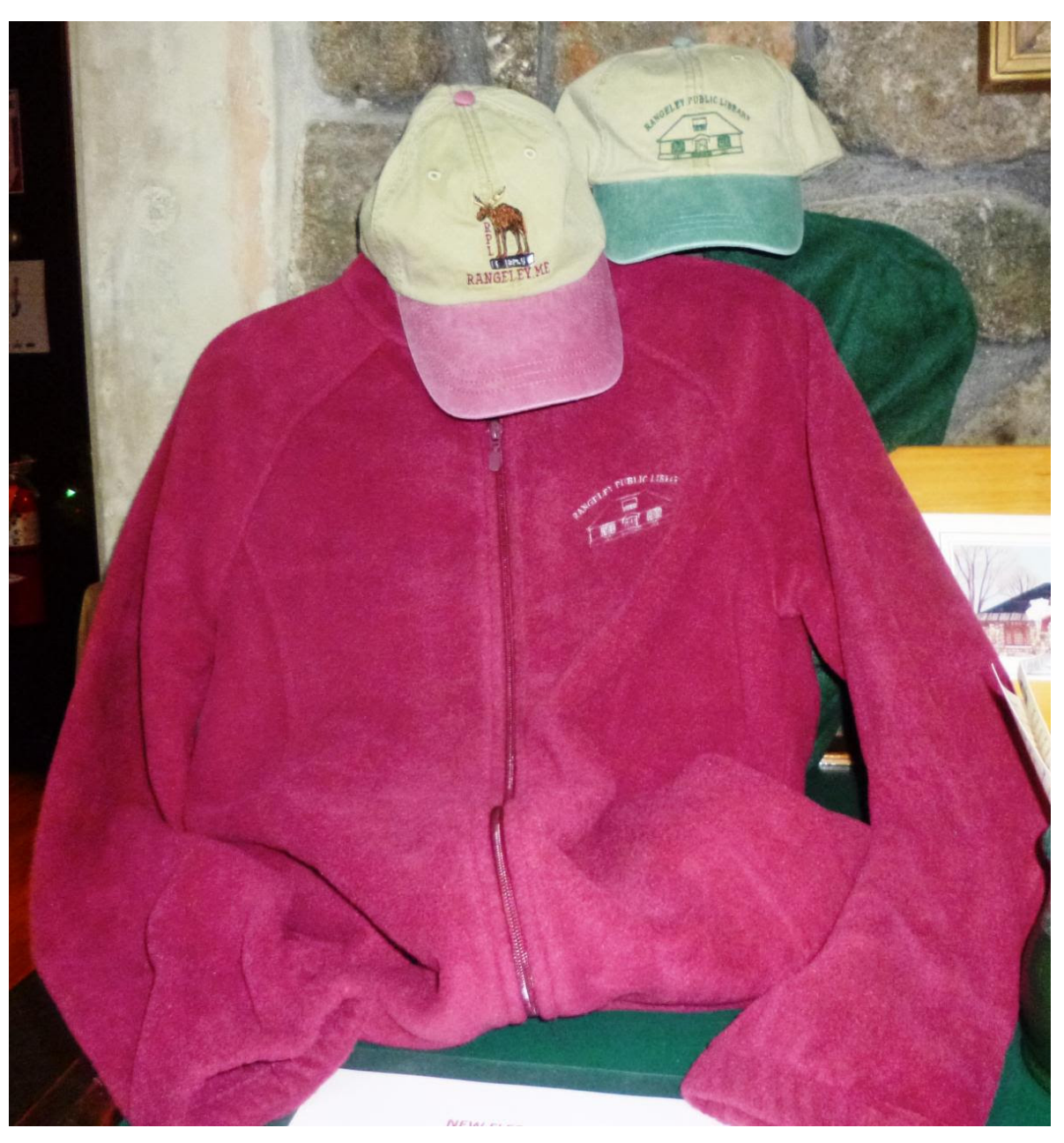
Items with Rangeley Public Library Logos make great gifts for all of the library lovers on your list.