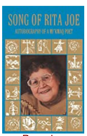
Rangeley Readers' December Pick

Book Groups - 3rd Weds. at 10:00 AM and last Weds. at 4:00 PM OWL Club meets every Thursday at 2:45 when school is in session. Preschool Story Hour meets at 10:00 AM on Fridays.