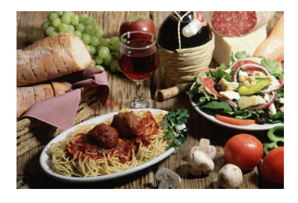
Annual Spaghetti Dinner February 15th