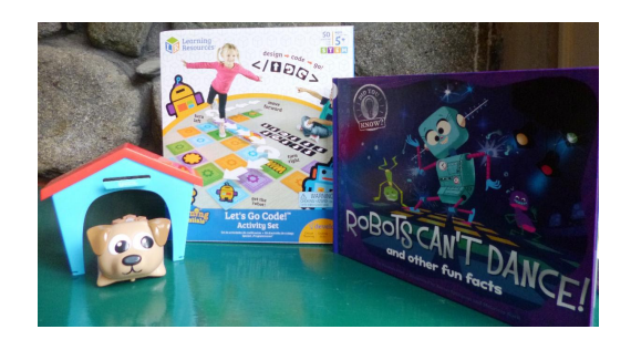
Robotics & Coding Kit for Preschool to Grade 3