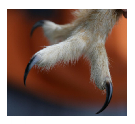
Fur, Feathers, & Feet 10:00 - 11:00 AM

We will explore how birds and mammals are alike and how they differ. There will be hands-on materials as well as a visit from some live specimens.