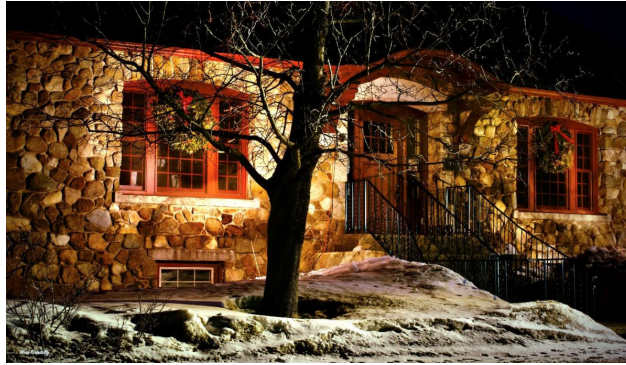
Winter 2022